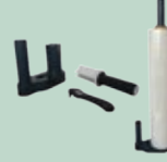
Hand Wrap Dispenser