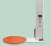
Pallet Wrapping Machine