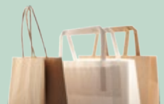
Paper Carry Bags