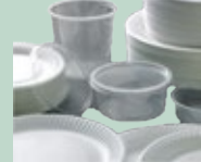
Paper Plate & Containers