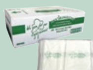
Degradable Kitchen Tidy