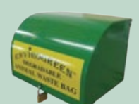
Dog Waste Bags Dispenser