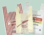
Printed Singlet Bags