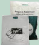
Die Cut Handle Carry Bags