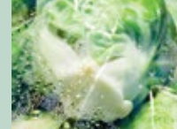
LDPE Bags (Fruit & Veg Bags)