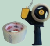
Tapes & Dispensers