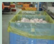
JD Jumbo Bags