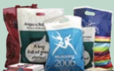
Printed Shopping Bags