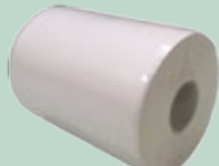
Paper Roll Towel