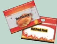
Chicken/Hot Food Bags