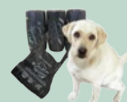
Dog Waste Bags