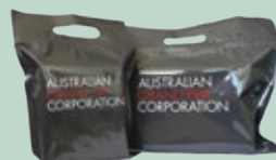
Premium Resealable Zip Carry Bags