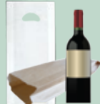
Paper/Plastic Bottle Bags