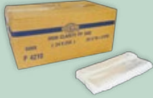
High Clarity PP Bags