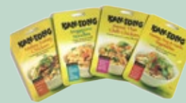
Food Packaging Bags